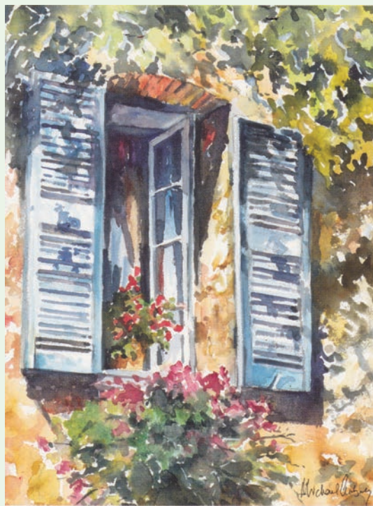
The open window