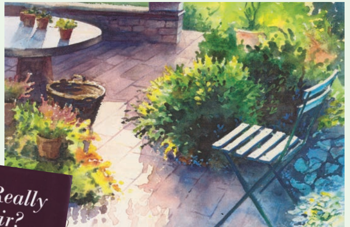
The garden chair