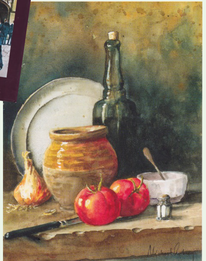
Tomatoes and a jar