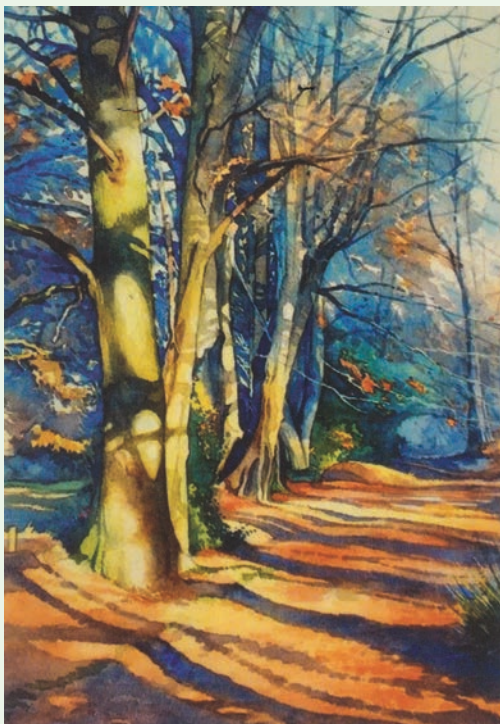
Path through the woods

His book Is That Really True, Sir? he describes as a memoir, but it is a tour de force, covering as it does a life so full of 'experiences'. Born into wartime Britain, he describes his early life with engaging detail. He read law at King's College, London, and Clare College, Cambridge, but the pull of adventure was already evident. He went alone on a summer course to Alsace while still at school; spent a vacation hitch-hiking to Italy; worked on a kibbutz in Israel; and, in 1964, 'on a whim' decided to take a look at America, which proved, as did much of his life, quite eventful.