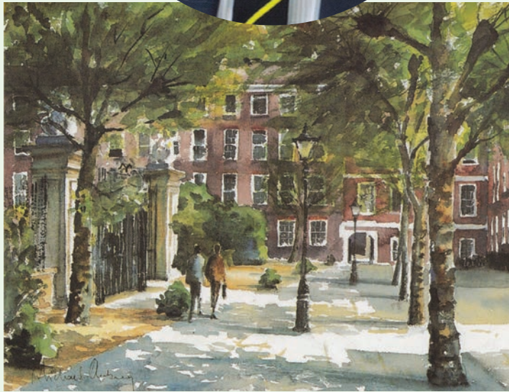
Field Court limited edition print