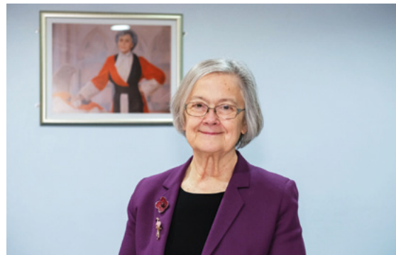
The Right Hon the Baroness Hale of Richmond DBE President of the Supreme Court, 2017 to 2020 Treasurer of Gray's Inn, 2017

In these pages you will learn more about what to expect and what you will need to do. You will also learn why, like me, you should set out on your journey at Gray's Inn.