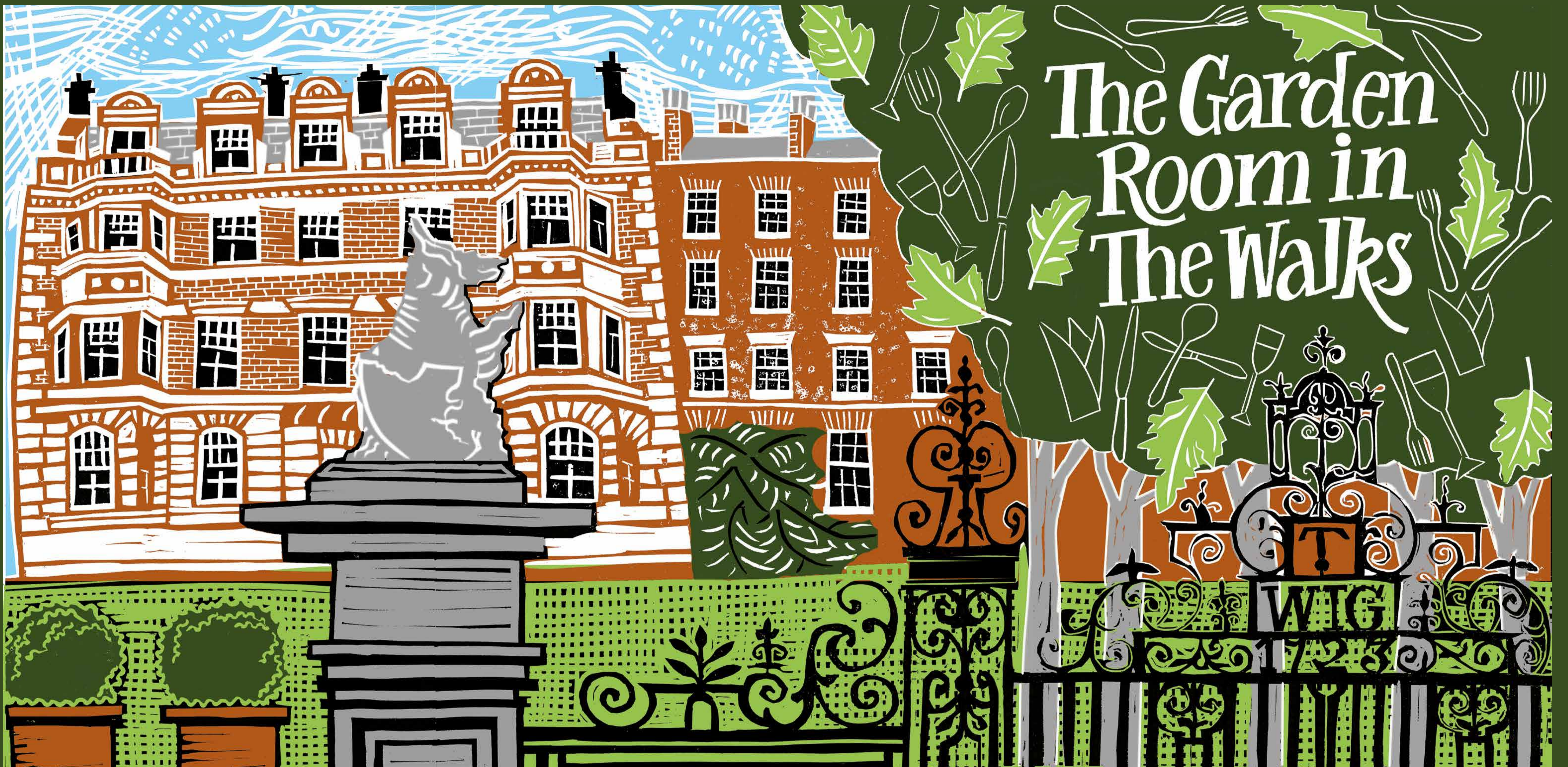
Illustration by Sally Castle

Enjoy a taste of Summer in our alfresco marquee restaurant